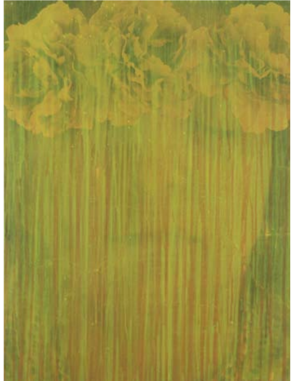
Homage to Twombly, Yellow (2012) , Mixed media on rice paper on canvas, 48*36 inch