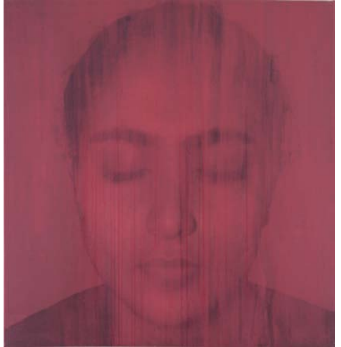
6000 Years Old (2012) , Mixed media on rice paper on canvas, 38*76 inch