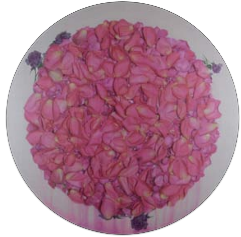
Energy, I - 2 - 3 (2012) , Mixed media on rice paper on canvas, diameter 48*48 inch