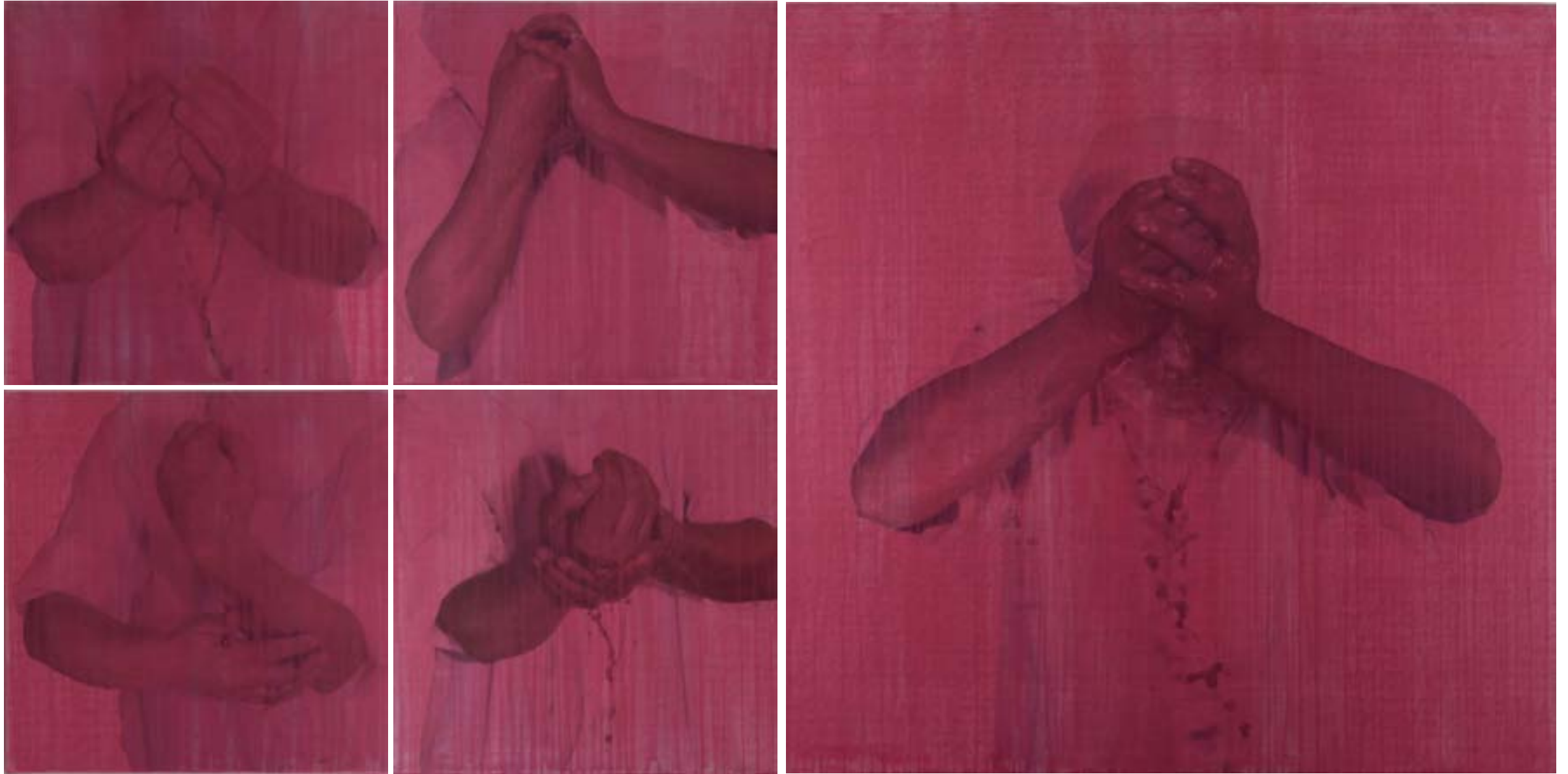
Ablutions (2012) , Mixed media on rice paper on canvas, 54*108 inch