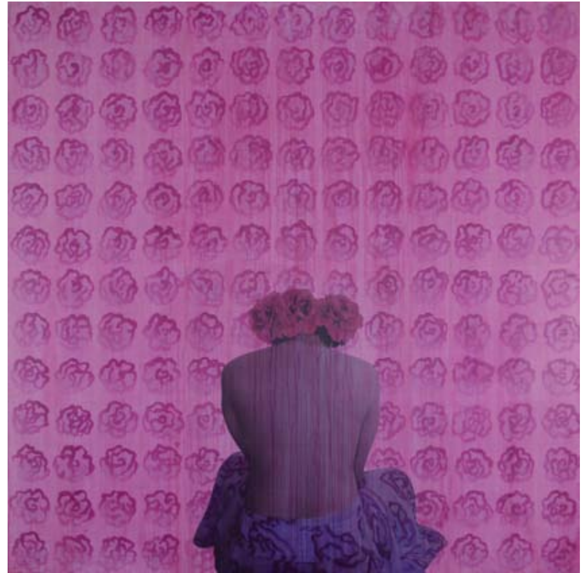
Rose Language (2012), Mixed media on rice paper on canvas, 78*78 inch