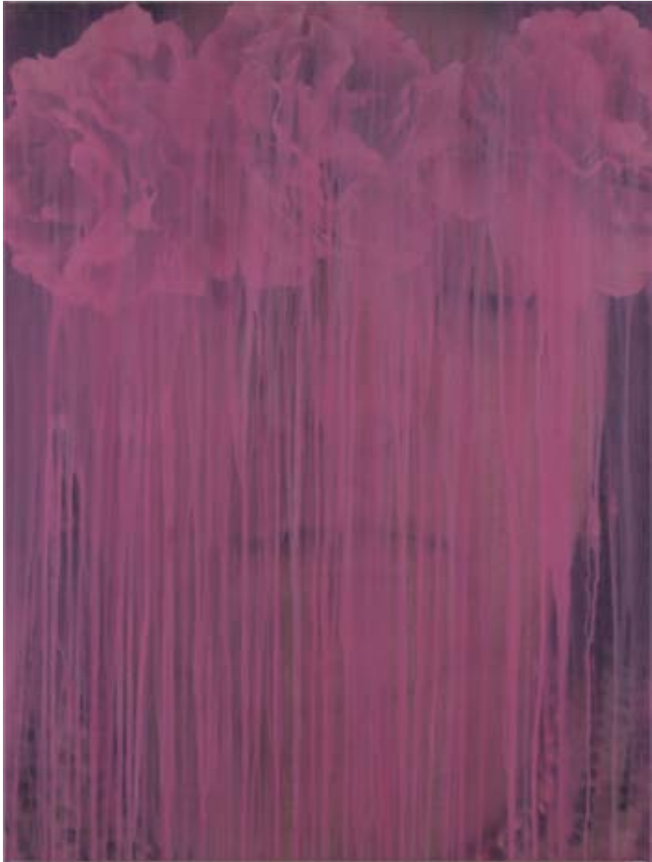
Homage to Twombly, Pink (2012) , Mixed media on rice paper on canvas, 48*36 inch