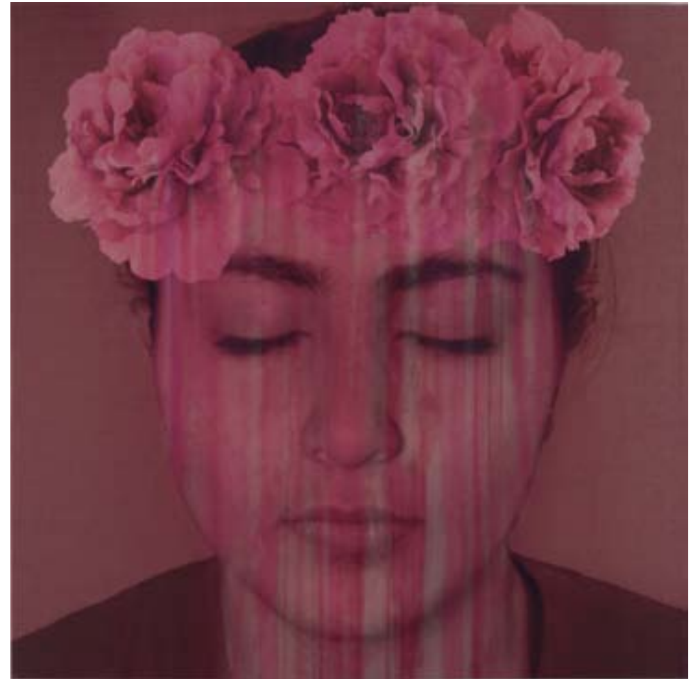
Face from Ur (2012) , Mixed media on rice paper on canvas, 38*38 inch