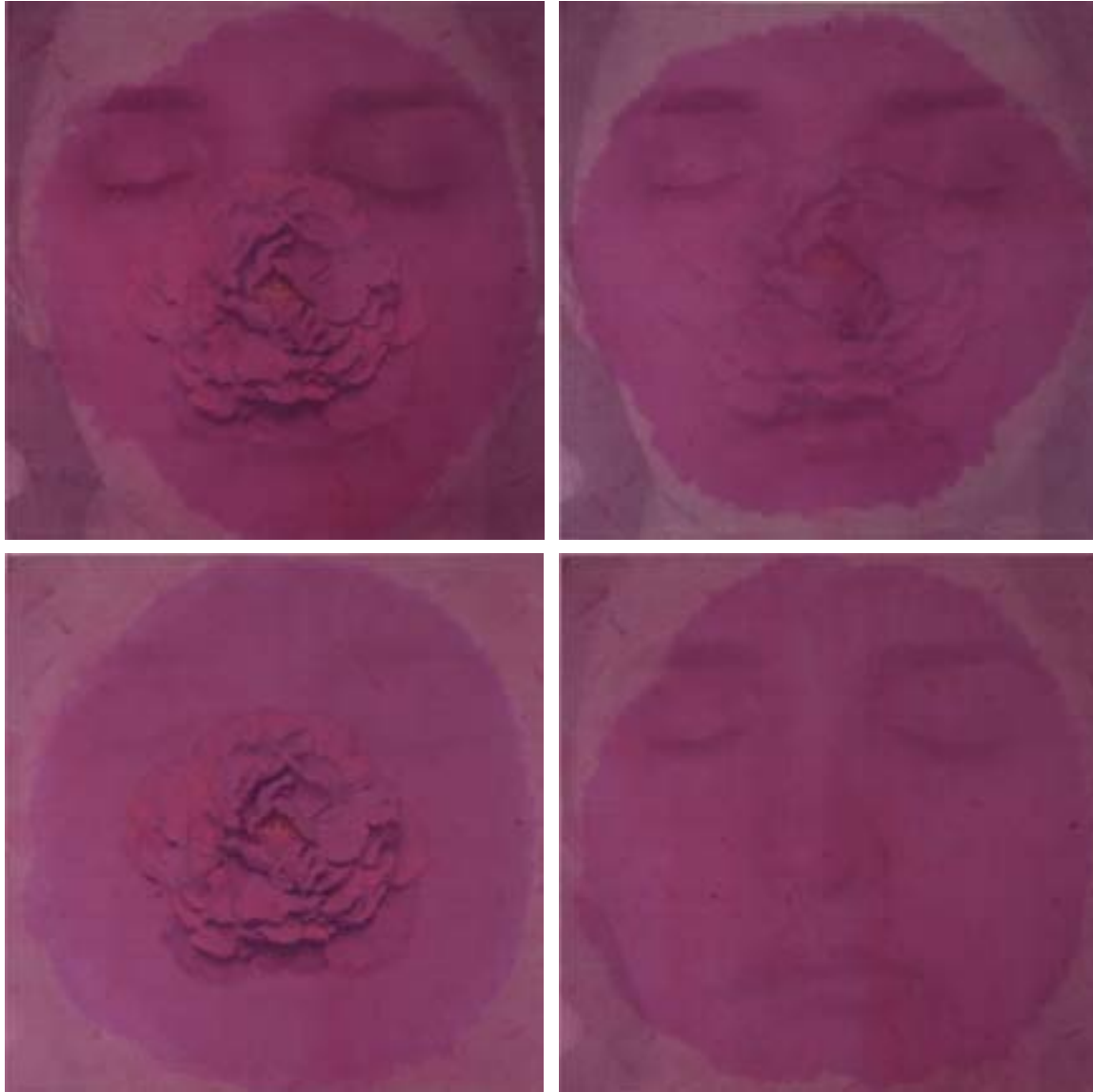
Dissolution (2012), Mixed media on rice paper on canvas, 64*64 inch