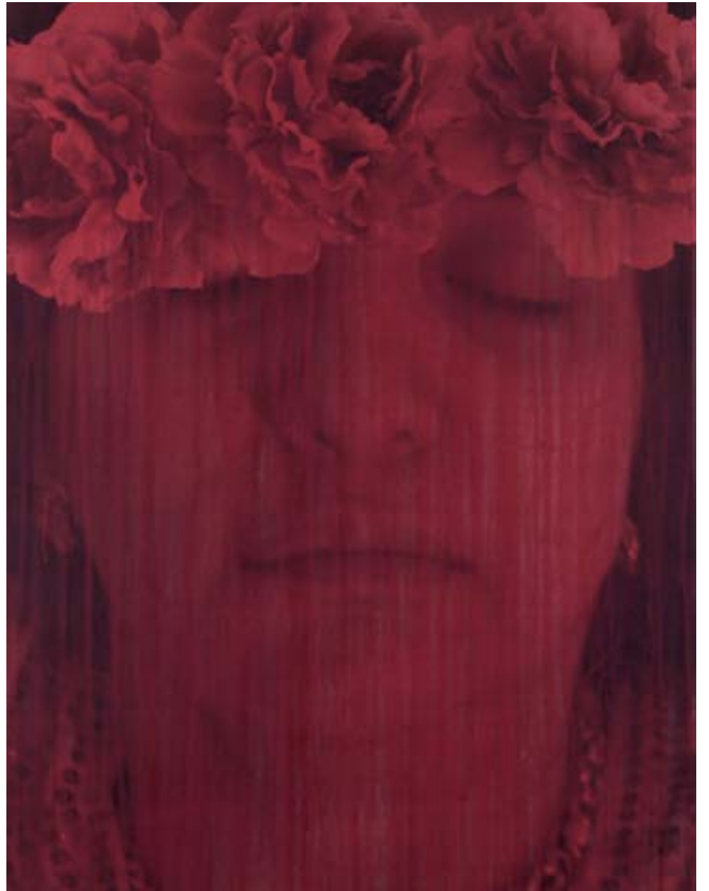
Homage to Twombly, Red (2012) , Mixed media on rice paper on canvas, 48*36 inch